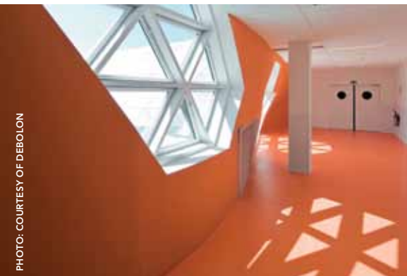
PVC flooring: enhanced walking comfort, good footfall sound reduction, anti-slip, warm, particularly durable surface coating

Sustainable Energy Use: “We will help to minimise climate impacts through reducing energy and raw material use, potentially endeavouring to switch to renewable sources and promoting sustainable innovation.”