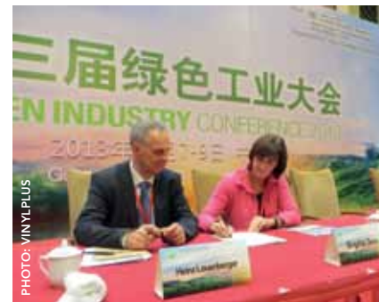
Official signature of the Green Industry Platform Statement of Support

Sustainability Awareness: “We will continue to build sustainability awareness across the value chain – including stakeholders inside and outside the industry – to accelerate resolving our sustainability challenges.”